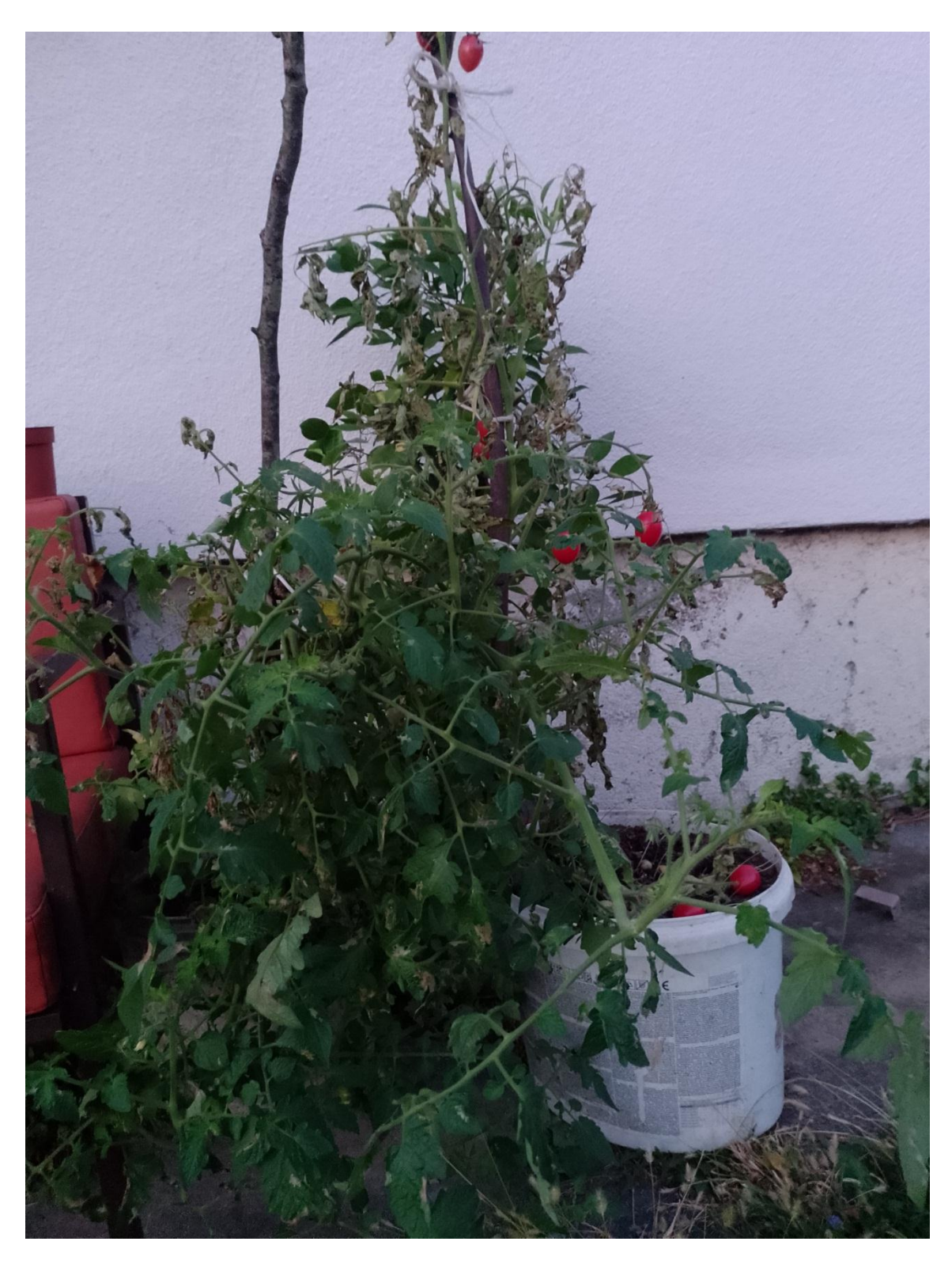
My cherry tomato