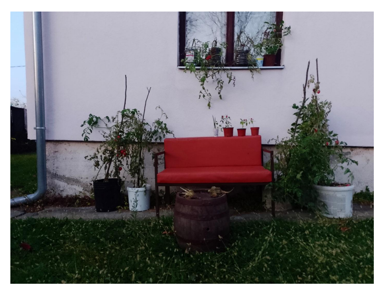
Salad garden with a unique table