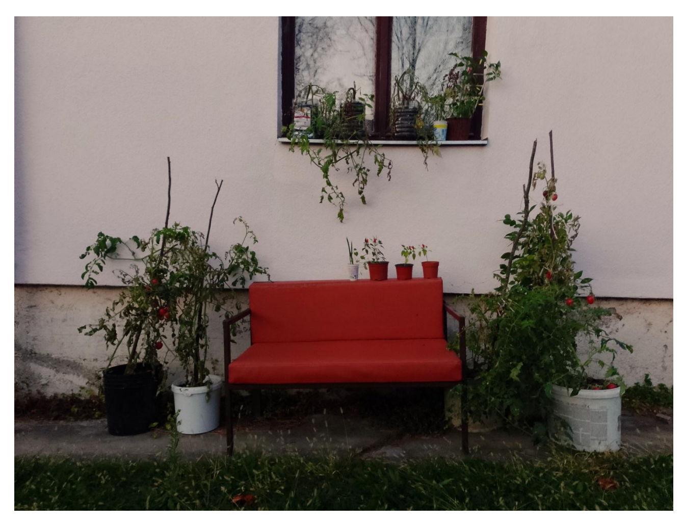
My salad garden Author Željko Radović

This year I have tried to make my own hanging vegetable garden at home and learn as much about salad vegetables and the way they are treated. I lack the hanger.